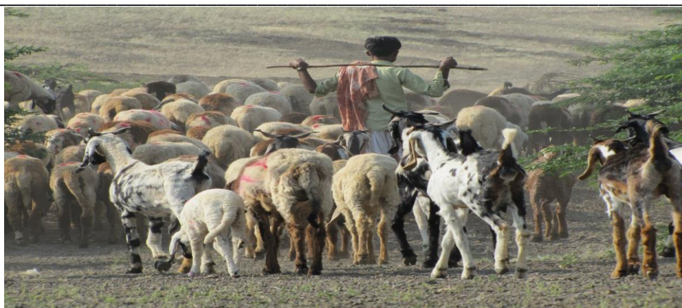
Figure 2: The above diagram shows nomadic herder searching for lands of green grass[6]

Figure 2 shows Nomadic herder searching for lands of green grass. As discussed above, Nomadic Agriculture is a practice in which nomads with animals searches for land covered with grass and other low plants suitable for grazing animals especially cattle or sheep.