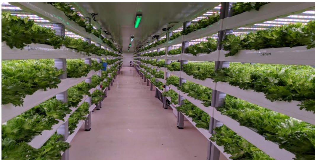
Figure 3: The above diagram shows the indoor vertical farming[9]

Indoor vertical farming is a contemporary agricultural method that can boost crop yields, alleviate land constraints, and even lessen the environmental effect of farming by reducing the distance travelled in the supply chain. Indoor vertical farming is the technique of producing food in a confined and regulated environment, layered one on top of the other[8]. Instead of planting and growing your crops horizontally across acres of fields, vertical farming allows you to plant and grow them vertically, either stacked in layers or directly on a wall. Because of its capacity to thrive in small spaces, this form of farming is frequently linked with city and urban farming. Some vertical farms are unusual in that they do not require soil for plant growth. Artificial grow lights are utilized in the absence of natural sunshine, as seen in Figure 3.